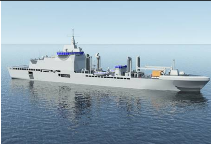
ALMACO Subcontracted for FLOTLOG Program