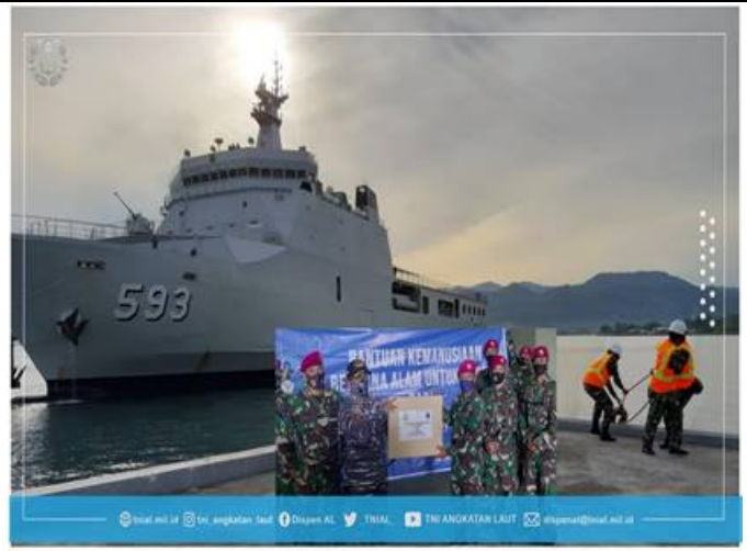
Indonesian Navy Delivers HADR Supplies to Mamuju