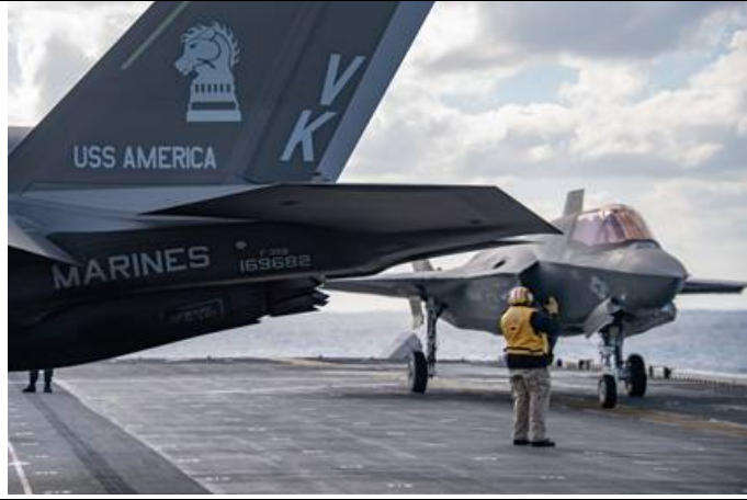
Lightning strikes again onboard USS America