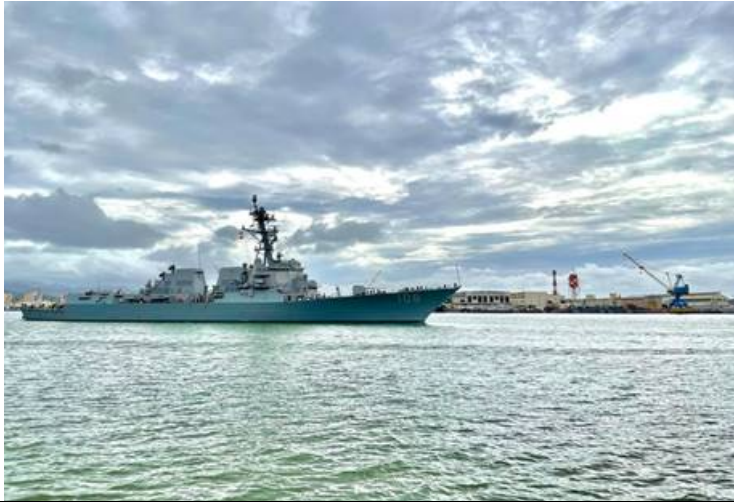
HRMC Completes USS Wayne E. Meyer Availability Ahead of Schedule