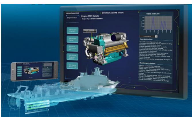
NERVA Ship Management System and Sensemaking System (SMS 2 )