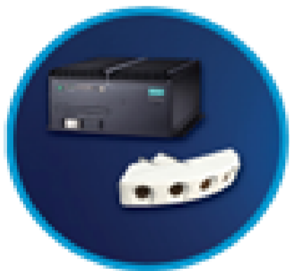
Scanned Panoramic Electro Optics System