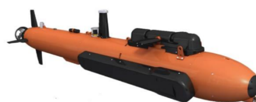
Autonomous Underwater Vessel