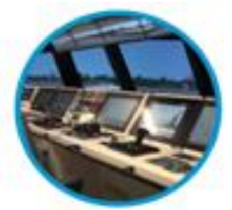
Link to Fleet Management Centre