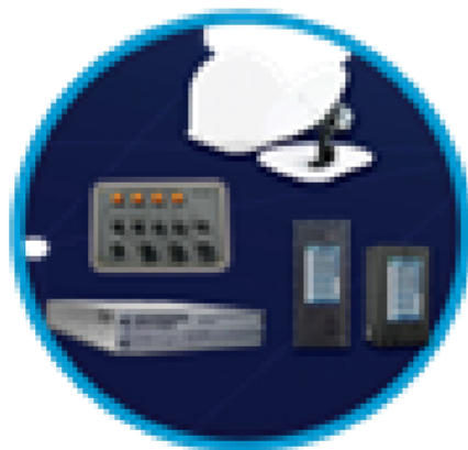
Satellite Communication System