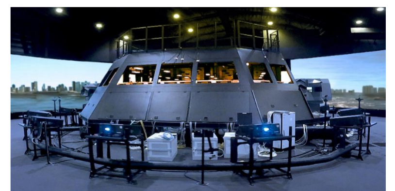
Training and Simulations