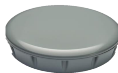
GNSS Anti-Jam Protection