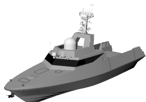
Swift 18m USV