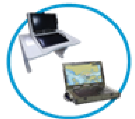
Situational Awareness Traffic Management