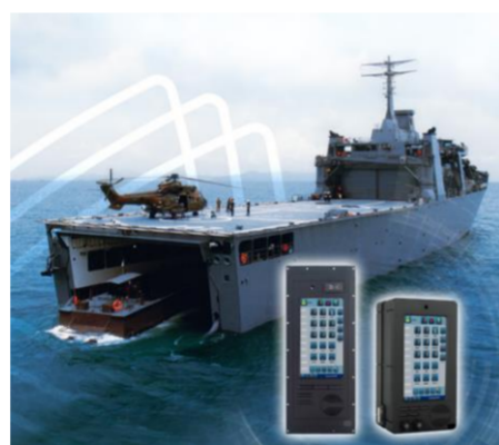
Integrated Communication System