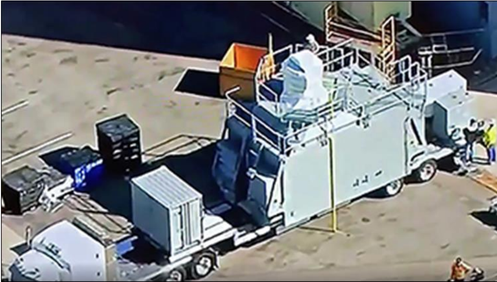
Figure 7. Reported SSL-TM Laser Being Transported