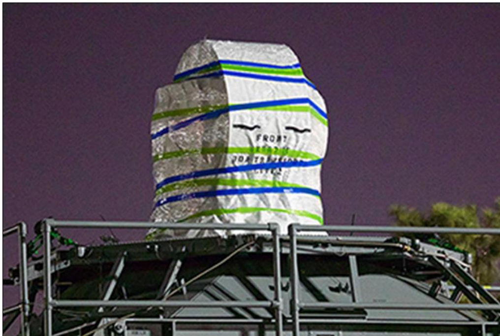
Figure 8. Reported SSL-TM Laser Being Transported