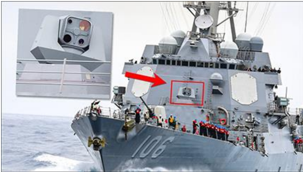
Figure 9. Reported ODIN System on USS Stockdale