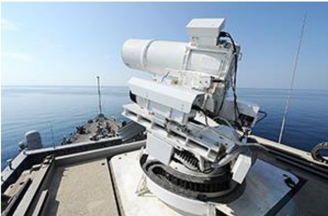
Figure 2. Laser Weapon System (LaWS) on USS Ponce