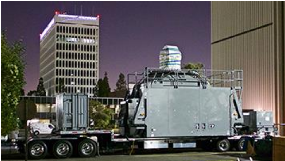
Figure 6. Reported SSL-TM Laser Being Transported

Source: Photograph accompanying Tyler Rogoway, "Mysterious Object Northrop Is Barging From Redondo Beach Is A High-Power Naval Laser," The Drive , October 18, 2019. The photograph is a cropped version of a