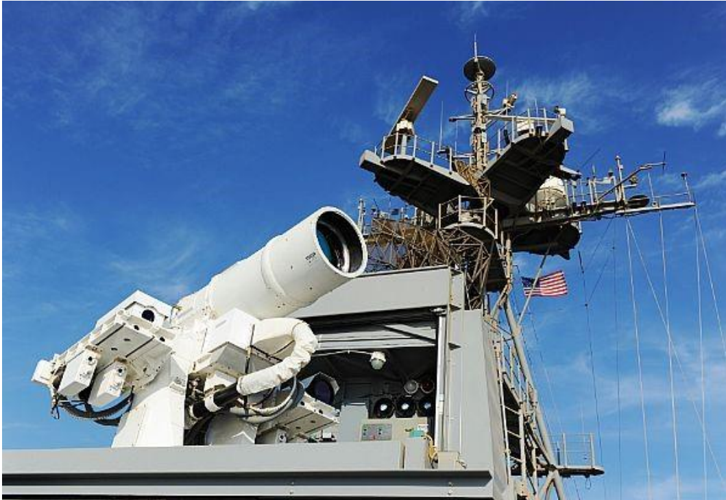
Figure 1. Laser Weapon System (LaWS) on USS Ponce