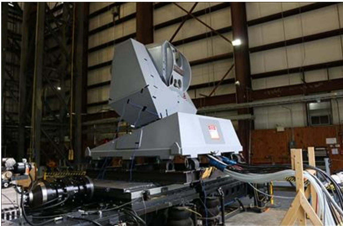
Figure 10. Reported ODIN System at Naval Support Facility Dahlgren

Source: Photograph accompanying Brett Tingley, “Here’s Our Best Look Yet At The Navy’s New Laser Dazzler System,” The Drive , July 13, 2021. The caption to the photo states that it shows “OSIN being tested at Naval Support Facility Dahlgren [VA] in 2020.” The article credits the photograph to the Navy.