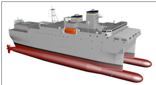
Figure 4. Notional Navy Design for TAGOS-25