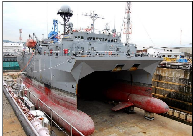
Figure 2. USNS Effective (TAGOS-21) in Dry Dock