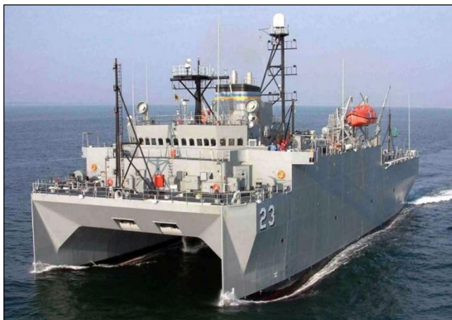
Figure 1. USNS Impeccable (TAGOS-23)